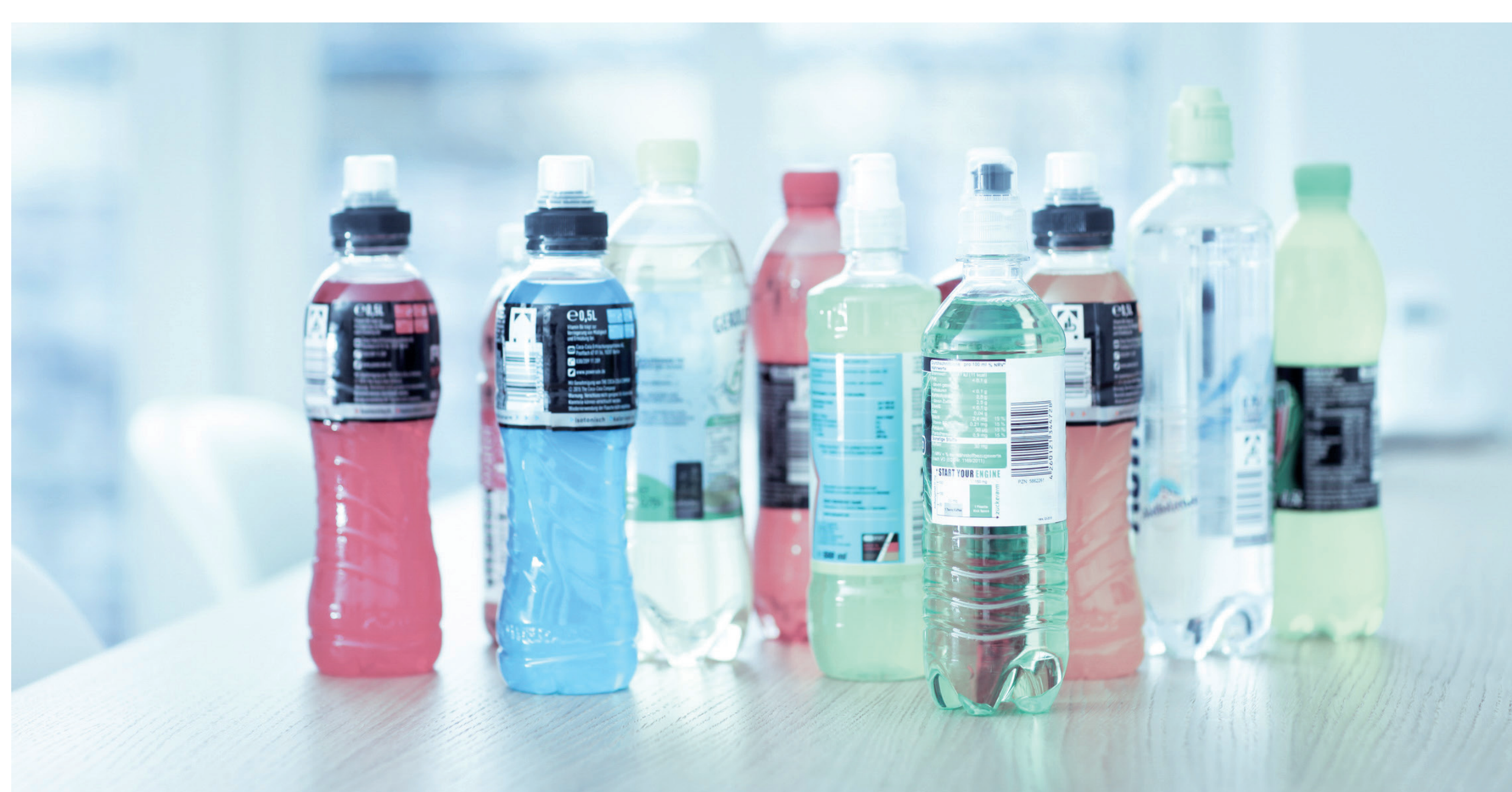
Fig. 1 Isotonic beverages

Six different samples of isotonic and non-isotonic drinks were measured, the osmolality was determined using the K-7400S osmometer which correlates freezing point depression with osmolality. The osmometer was calibrated in a range of 0-850 mOsmol/kg for isotonic samples and in a range from 0-2000 mOsmol/kg for non-isotonic drinks, respectively. Ten replicates were measured for each sample using a sample volume of 150 \mu L. The diagram in Fig.2 shows the average values of osmolality for the isotonic samples together with the EFSA limits. The non-isotonic beverages have a much higher osmolality. For samples of caffeine containing soft drink and beer osmolalities of 644 mOsmol/kg and 1008 mOsmol/kg, respectively, were determined. As alcohol is also depressing the freezing point, the osmolality of alcoholic beer is much higher than its non-alcoholic isotonic alternative.